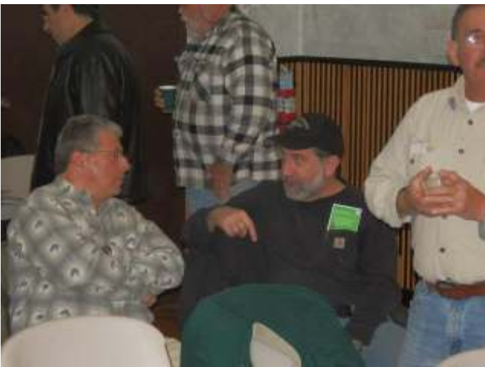
At last year's Banquet I won a flat screen TV!! You don't say.....