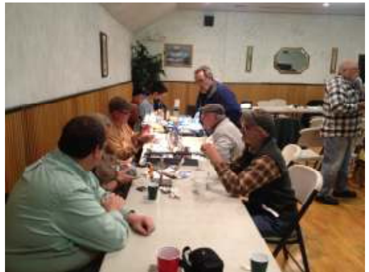
Some interesting fly tying going on here!

Join Trout Unlimited - Help Preserve Our Cold Water Fisheries Membership Application on Page 7.