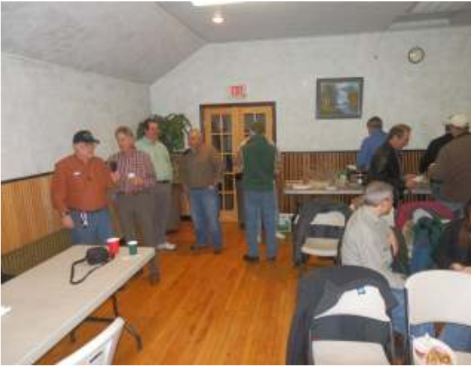
The story telling corner..... AKA .....Bull Alley