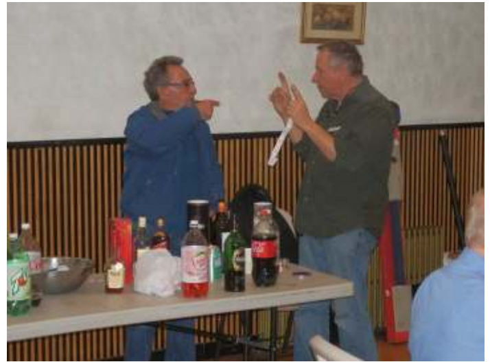
What size was that fish?